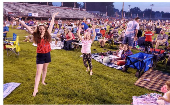
Welcome back to Fireworks pre-show! (pg 4)